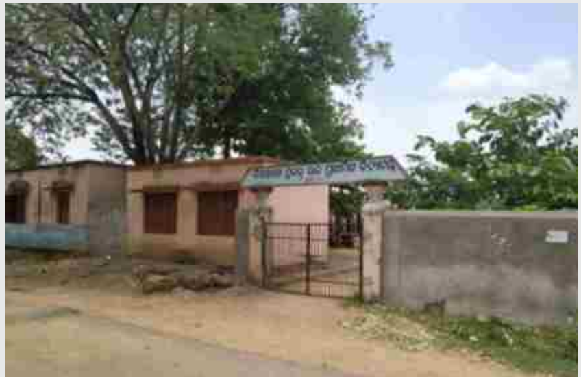
Tikarpada PUPS with Boundary Wall

Some local ill-intentioned people use the school building for drinking alcohol during off hours. Even if they were misusing the school toilet soiling it entirely and spread dirt along the tube well. The absence of the boundary was the biggest obstacle for development and beautification of the school. The School Management Committee (SMC) was not function properly and they couldn't find a solution for the same. In the mean time YCDA with the support of Save the children organized the series of trainings for SMC members. The trained SMC members went ahead & identified that a boundary could be a possible solution. This transformation came about with the active participation of school management committee members.