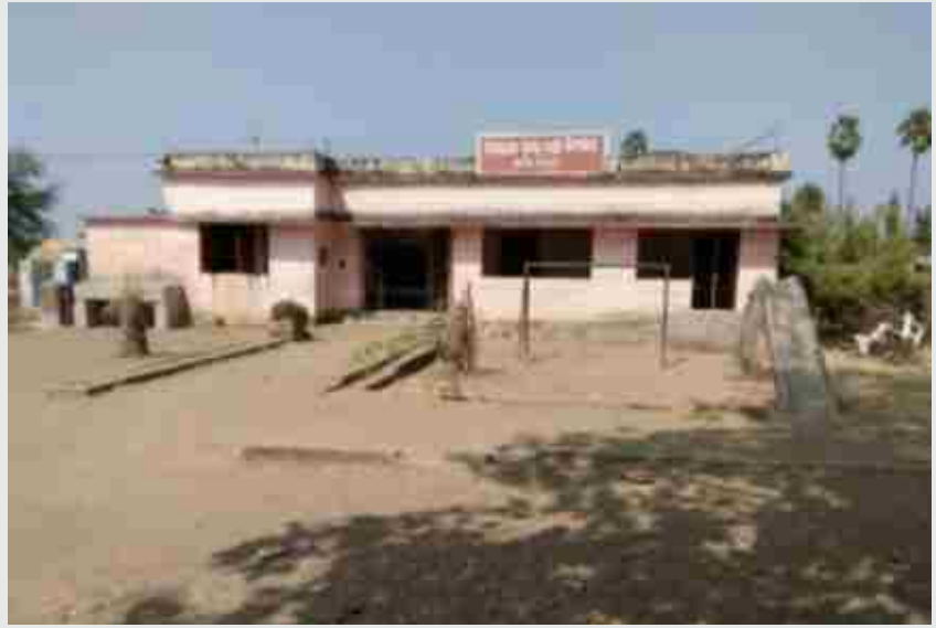
Tikarpada PUPS with No Boundary Wall

Tikarpada Project Upper Primary School is situated in the village Tikarpada of Boudh District. Tikarpada village is geographically a larger village as compared to other villages. Here most of the people are from the tribal communities. The school is situated in a populated area and has a road in front of it. The strength of the school is 180 students. There were eight government teachers available to run the school. The biggest problem of the school was without boundary walls.