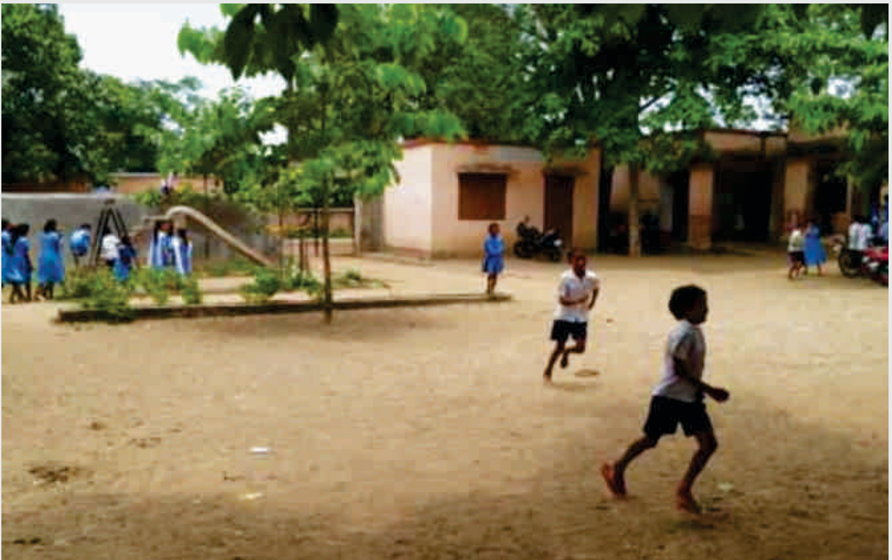
Children were enjoying their school life

understood how their participation can bring change in them and in others, how bad impacts of early marriage can harm their society, importance of Birth certificates, the facilities they should avail and the rights they should enjoy. Thus each and every member of the child club, due to regular trainings and meetings became quite expert in identifying child protection issues. They first identified that non-existence of the AWC building as a problem and raised this issue in the Village Child Protection Committee (VCPC) of the same village. The Village Child Protection Committee (VCPC) took it seriously and informed about this to the Sarpanch through the Panchayat meeting. Subsequently the Sarpanch brought it to the notice of the BDO. Then in a block level meeting, attended by high level officials like BDO, DEO, BEO, CDPO, PD-DRDA, this matter was discussed. It was decided that the BDO will take the lead role to sort out the problem after due inquiry. Thus just after two weeks of his assurance, the work started and took 4 months to be complete. The construction work of the AWC building came to an end very recently. Now AWC is functioning from its own building, small children within the age group of 3 to 6 years are coming to the center regularly and availing due educational and other benefits being provided by govt. The parents are also very happy as their children are no more sitting under the open sky and no more facing problems of rain.